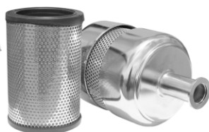
P/N P101878 $165.00