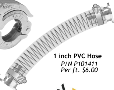
1 inch PVC Hose P/N P101411 Per ft. $6.00