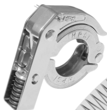
KF25 Toggle Clamp P/N P101638 $13.25