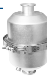
P/N P102029 $315.00