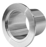
KF25 Half Nipple P/N P101218 $14.25