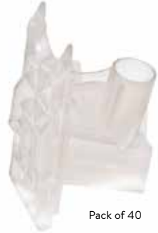
Pack of 40

Double sample holder with card (up to 1ml)