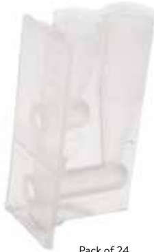
Pack of 24

Single sample holder with card (up to 1ml)