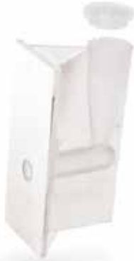
Pack of 24