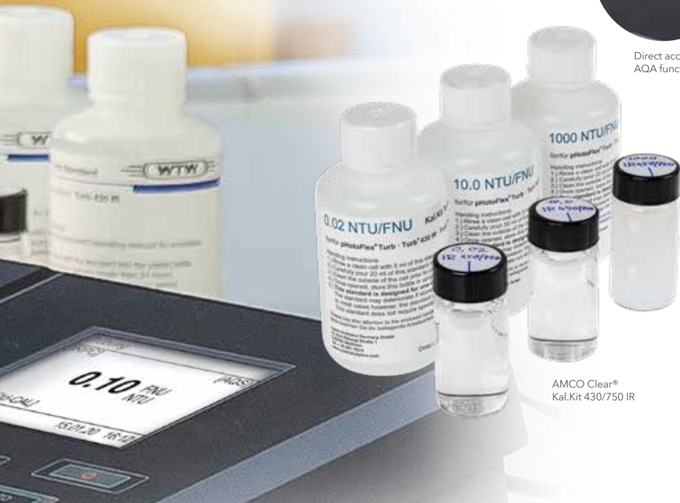
AMCO Clear® Kal.Kit 430/750 IR