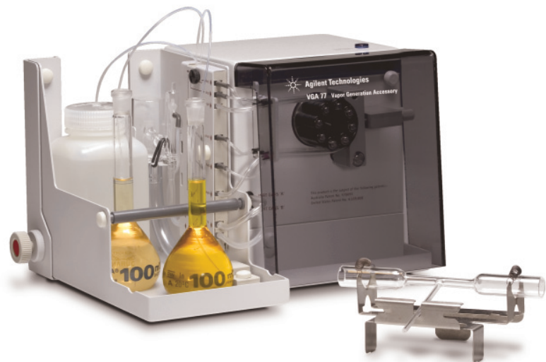
Figure 1. The VGA 77 Vapor Generation Accessory provides fast, accurate determination of Hg and hydride forming elements at ppb levels simply and automatically.