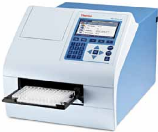
Thermo Scientific Multiskan GO without cuvette port