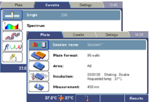
Easy to use internal software for quick plate or cuvette measurements