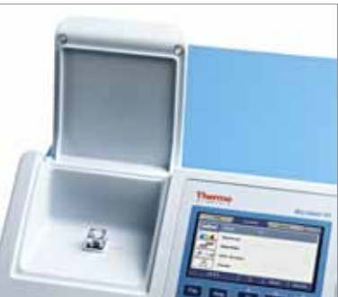
Multiskan GO accepts versatile cuvettes