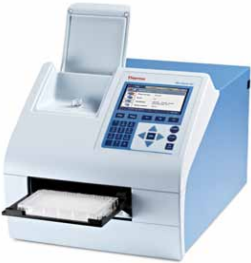
Thermo Scientific Multiskan GO with cuvette port