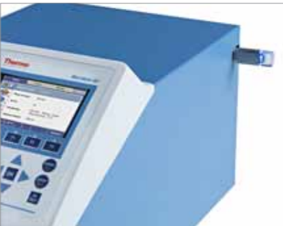
USB port for easy data transfer